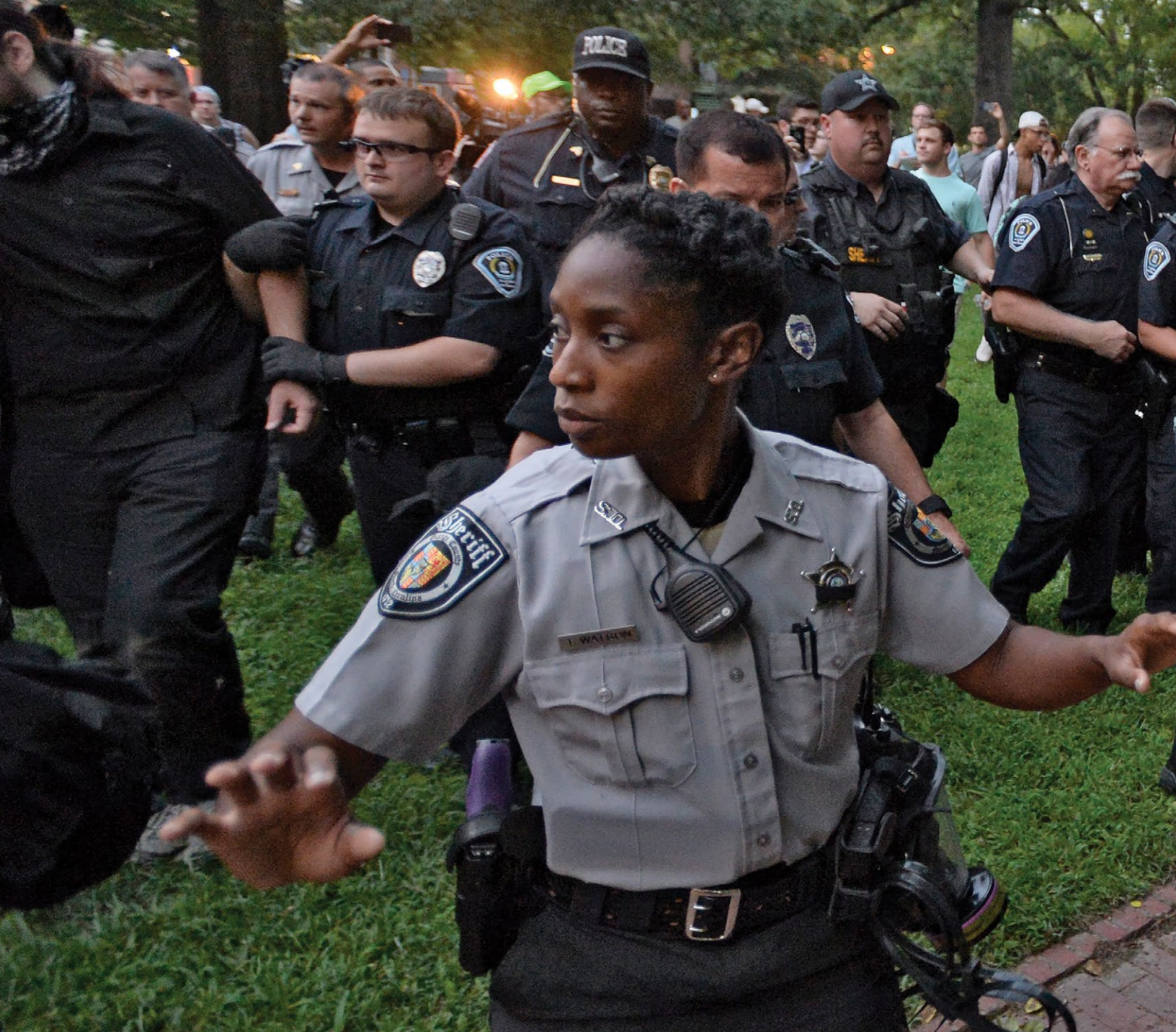
Police hold back demonstrators during a 2017 rally for the removal of Silent Sam, a Confederate statue on the campus of the U. of North Carolina. The statue was toppled in 2018.

and campus security. The director of the master's-degree program in criminal-justice administration at the University of South Florida, he also served with the institution's police department for 24 years, including as assistant chief. Since the January 6 insurrection in Washington, he says, intelligence sharing among local, state, and federal law-enforcement agencies has stepped up considerably. On the left and the right, there's