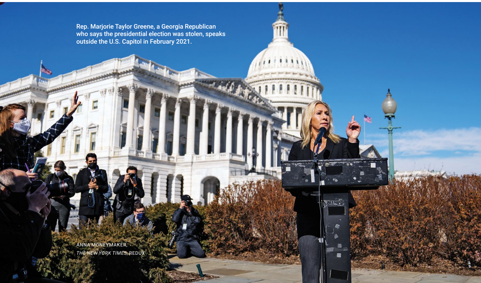
Rep. Marjorie Taylor Greene, a Georgia Republican who says the presidential election was stolen, speaks outside the U.S. Capitol in February 2021.