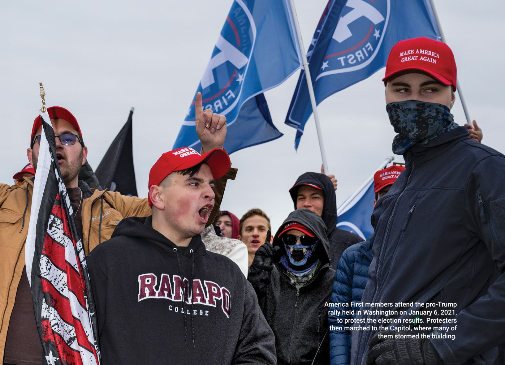
America First members attend the pro-Trump rally held in Washington on January 6, 2021, to protest the election results. Protesters then marched to the Capitol, where many of them stormed the building.