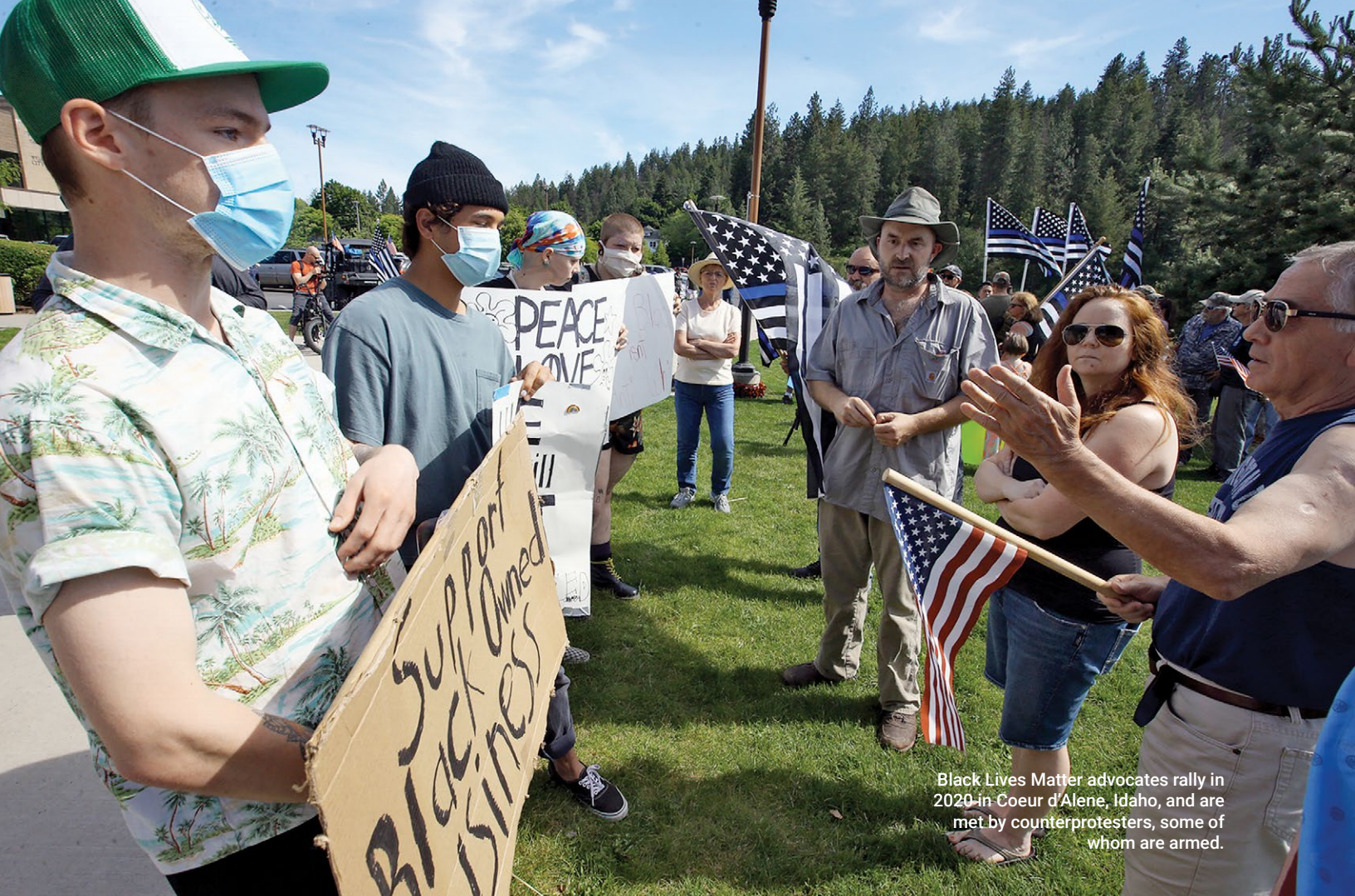
Black Lives Matter advocates rally in 2020 in Coeur d'Alene, Idaho, and are met by counterprotesters, some of whom are armed.